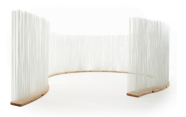
Sticks, the plant that doesn't need watering.

A biophilic space doesn't always require plants that need watering. One of the principles in biophilic design is 'mystery', when a space doesn't reveal all of its details in one go. Offices and living spaces, need to have some secluded areas, but need to keep their welcoming atmosphere. This is what makes Sticks a great biophilic solution, you can play around with dividing a space and keep things feeling open and connected.