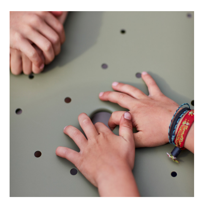
Did you know that the perforated pattern in the tabletop of Virus, is inspired by spiral shaped galaxies.